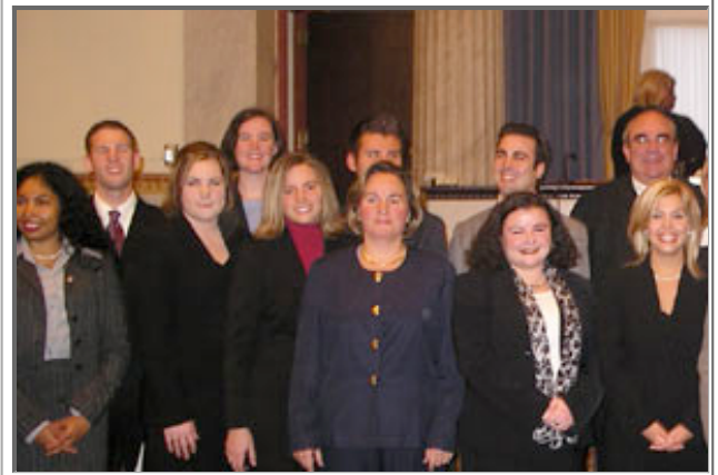
The Philadelphia ceremony inductees

All images and content © 2007 Widener University School of Law