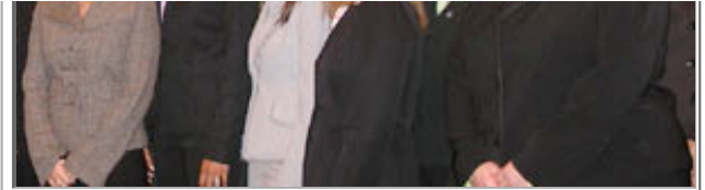
The Philadelphia ceremony inductees