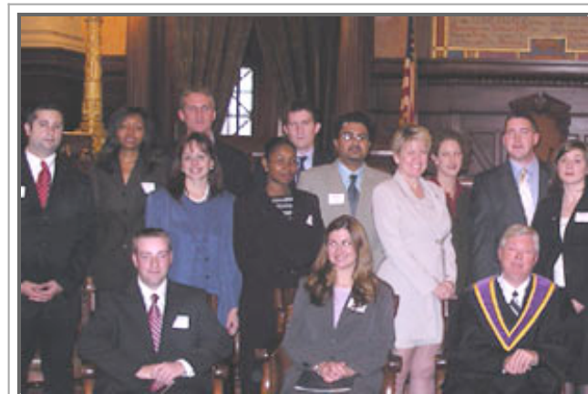
The Harrisburg ceremony inductees