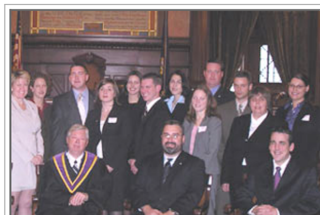
The Harrisburg ceremony inductees