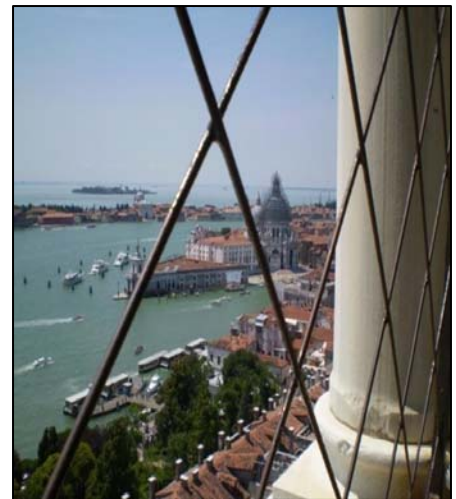
Venice Summer Law Institute

Some of you are already captivated by one of these fascinating cities. Each program is really different and each provides amazing opportunities to live in and learn about different cultures.