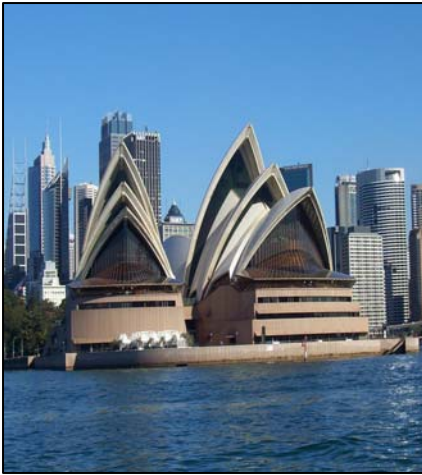
Sydney Summer Law Institute

Stretch your perspective by adding a law-related experience that stands out to employers and may open opportunities in the increasingly global world of law practice.