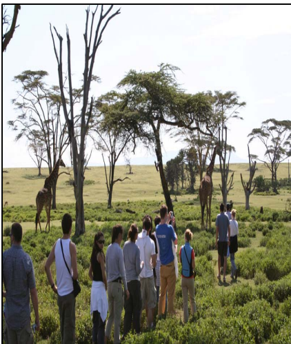
Nairobi Summer Law Institute

Some of you are already captivated by one of these fascinating cities. Each program is really different and each provides amazing opportunities to live in and learn about different cultures.