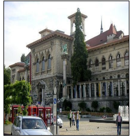
Lausanne Summer Law Institute

Stretch your perspective by adding a law-related experience that stands out to employers and may open opportunities in the increasingly global world of law practice.