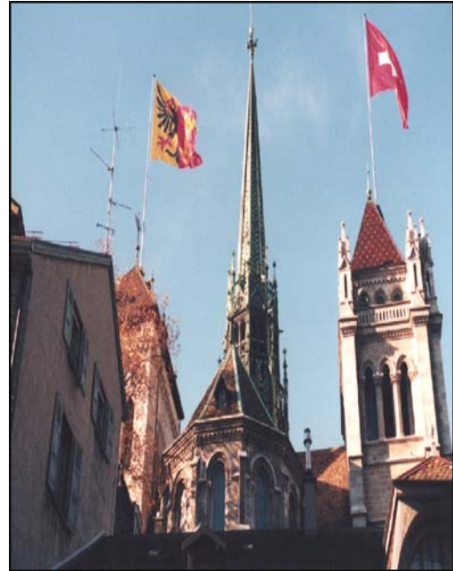
Lausanne Summer Law Institute

Stretch your perspective by adding a law-related experience that stands out to employers and may open opportunities in the increasingly global world of law practice.