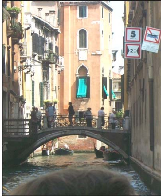
Venice Summer Law Institute