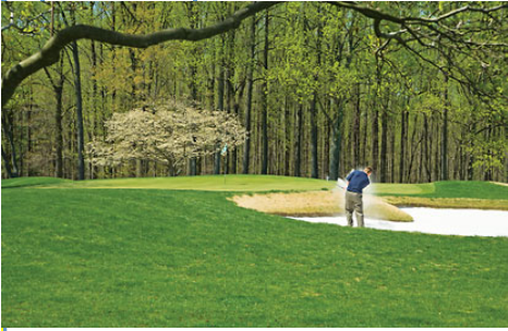
The 19th hole at Deerfield Golf Club