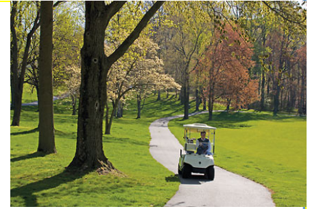
Deerfield Golf and Tennis club

Attention any students who want to meet and speak with attorneys in the area!! Honored alumni from the area who work in all different areas of the legal profession will be paired with students for an 18-hole tournament style golf event. The event will be held at the Deerfield Golf and Tennis Club in Newark, Delaware. The Golf course sits on acres surrounded by White Clay Creek State Park. The course is par 70 with a slope of 173 and a rating of 71.6. More information and directions to the facility can be found at www.deerfieldgolfclub.com . Foursomes will be set up two attorneys to two students.